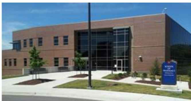
School of Pharmacy Building 2010 Becker Drive, Lawrence, KS

Workshop Lectures will be held in 2020 PHAR, Lunch will be available in 2040 PHAR, and coffee breaks and the poster session will be held in the Pharmacy Building Atrium.